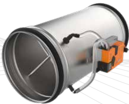
VAV Terminals Circular VAV Terminal Unit

The Variable Volume terminal type RVP-P enables precision control of the amount of air coming into and out of a room. It can be supplied with a variety of control options for different applications and is ideally suited for use with the TEL AFA5000 Room Space Controller.