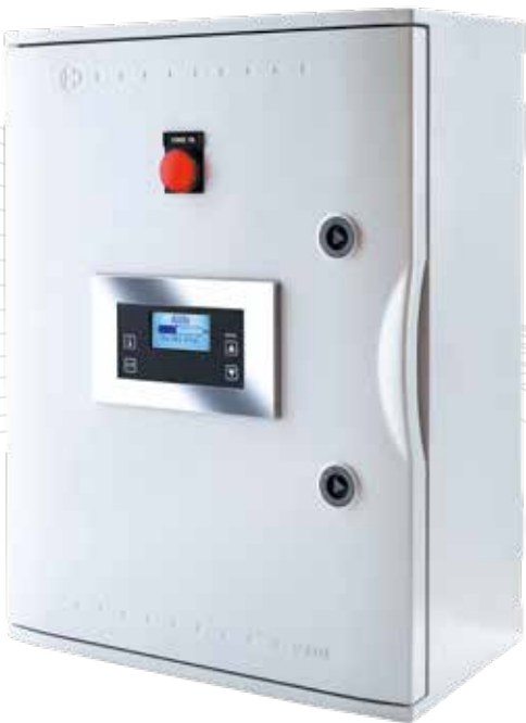
Kitchen Hood VAV System

TEL's kitchen control system can detect both smoke and temperature rises, increasing the airflow only when full performance is needed, significantly reducing energy costs and the carbon emissions of your kitchen hood.