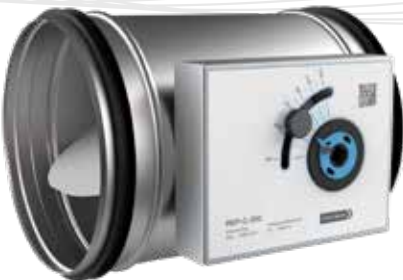
CAV Terminals Circular CAV Terminal Unit

The Volume flow controller type RKP-P maintains a constant volume on extract and supply air systems covering a wide range of sizes and volumes to suit any application. It keeps a default nominal value of the volume flow constantly, lastingly and independently of the varying pressure in the duct.