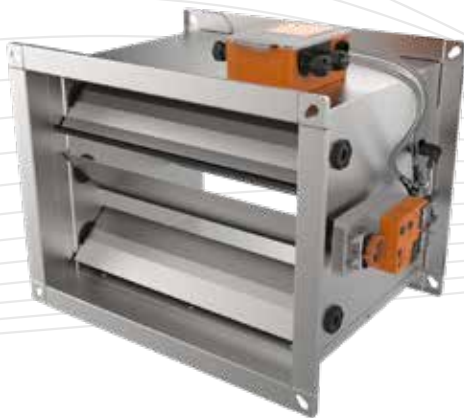
VAV Terminals Rectangular VAV Terminal Unit

Control the distribution of air into any building space or room.