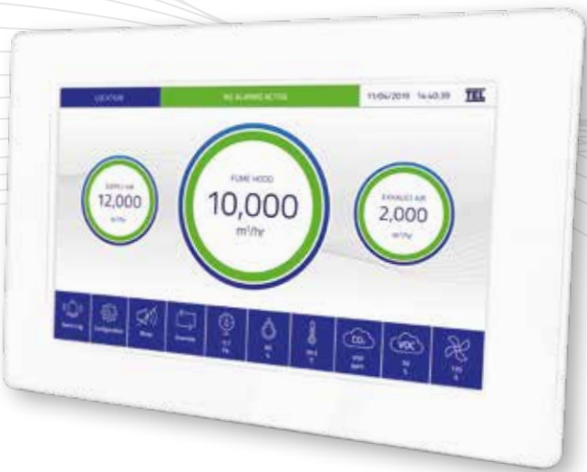
AFA5000 Laboratory Room Space Controller

The only Room Space Controller of its type available on the market, the AFA5000 can communicate directly with fume cupboard systems, measuring their precise airflow requirements and allowing air to be controlled exactly according to need, minimising energy consumption and allowing you the peace of mind to get on with the job at hand.