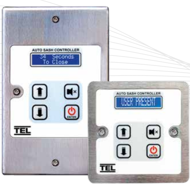
Auto Sash Controllers

TEL’s auto sash controller is designed to close the sash when the operator is not present in front of the fume cupboard. A passive infra-red (PIR) sensor constantly monitors the work area in front of the fume cupboard and if no movement is detected and the sash opening is clear, the sash will automatically close after a pre-determined time.