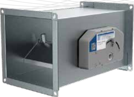
CAV Terminals Rectangular CAV Terminal Unit

Constant volume flow controllers work with a smooth-running, asymmetrically angled plate, which guarantees a sensitive response even where volume flow is low.